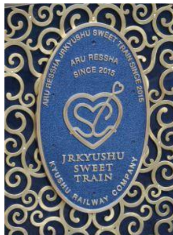
IRT photos by Owen Hardy